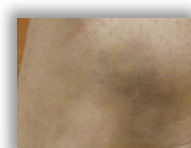
Post Treatment #6