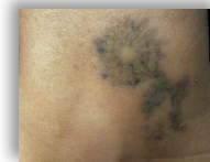
Post Treatment #1