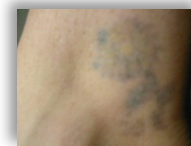
Post Treatment #2