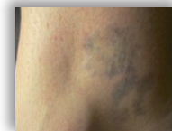
Post Treatment #3